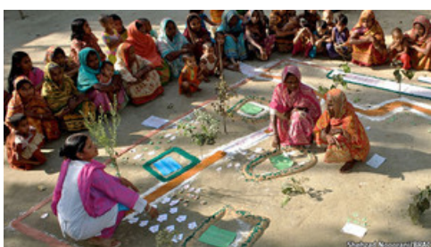
Villagers are doing it for themselves

Most of the big improvements have taken place in rural areas, but Bangladesh is urbanising fast, which will bring a different suite of problems. Dhaka is one of the ten largest cities in the world, but has the infrastructure of a one-buffalo town.